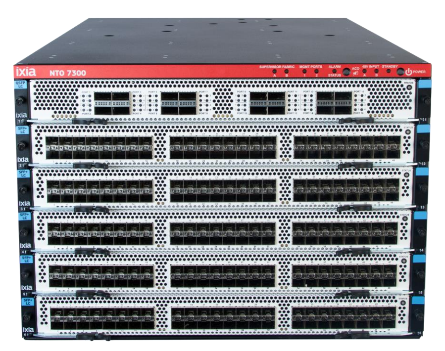
Figure 1 – 7300/7303 Appliance

The NTO 7303 appliances relies on two processors to run the NTO and ATIP firmware. The supervisor modules and ATIP line card include the Intel Core i7-3555LE processor, and the remaining line cards (except for the smart blank module line card) include the Intel Atom N2600 processor.